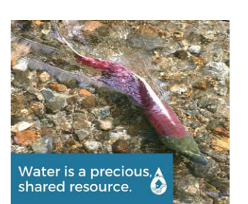
Future generations are counting on us to preserve water resources. Even though our region is known for rain, each year we have a 'summer crunch' when water demand is high and rainfall is low.