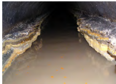
Grease going down the drain can cause serious problems in our sewers and your house drains and pipes.